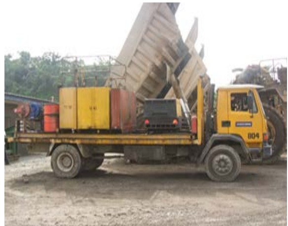
Fig 1 Side View of Existing Service Truck

Fig 1 and 2 show the supply nozzles and how they are exposed to dust. Each hose supplies a particular oil or fuel, such as water, TC-50, TC 15-40, TC-10 and grease. The hose which supplies the grease has a grease gun coupled to it to aid in greasing of bearings.