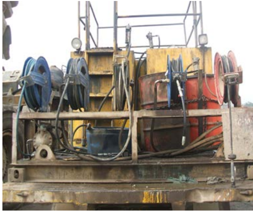
Fig 2 Back View of Existing Service Truck